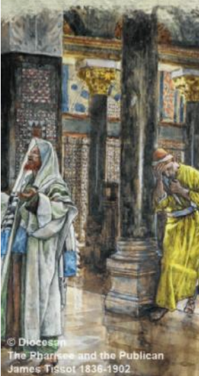
The Pharisee and the Publican James Tissot 1836-1902