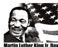
Martin Luther King Jr. Day

Parish Offices Closed Monday, January 20 for Martin Luther King Jr. Holiday